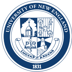
One Color (Pantone 294)