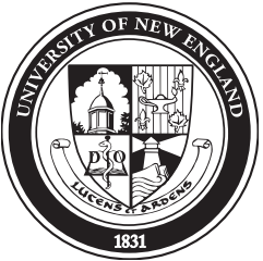
Black and White